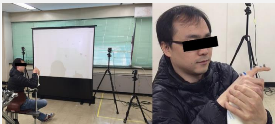
Figure 1. Experimental setting with five infrared cameras for capturing hand motion and a chair with an arm supporter to fix the forearm and hand